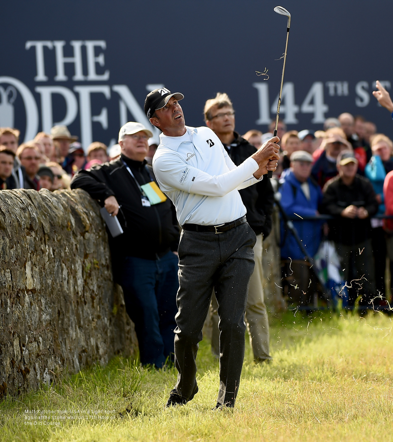
Matt Kuchar from USA in a tight spot against the stone wall on 17th hole of the Old Course