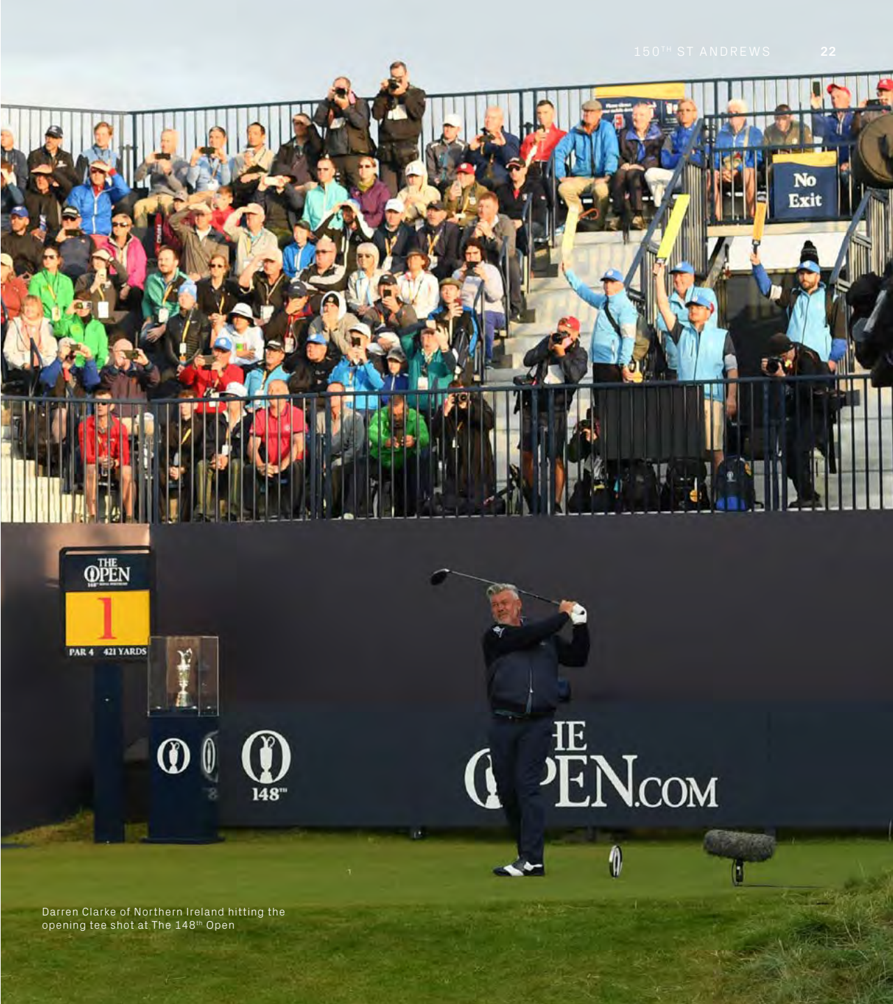
Darren Clarke of Northern Ireland hitting the opening tee shot at The 148 th Open